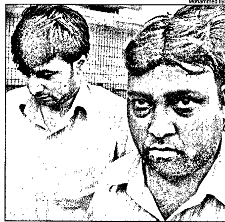
IN THE NET: The two accused work at the SC/ST cell of DU